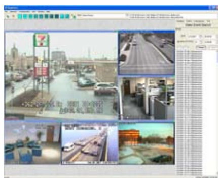
Video Event Search