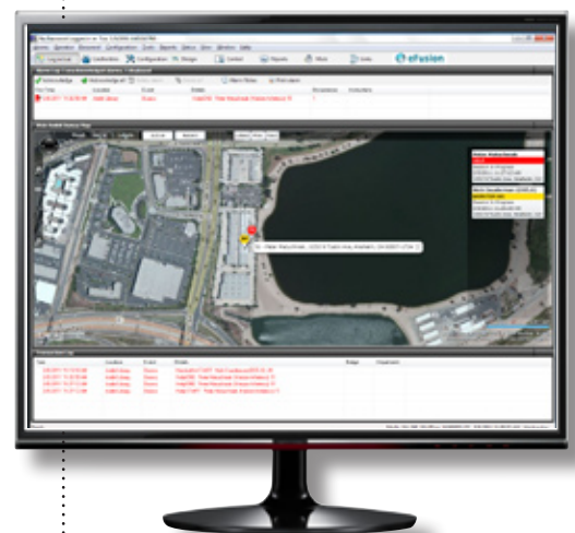
Geolocation map display

eMobile enables organisations to dramatically improve the effectiveness of their communication with their mobile workforce. The new smartphone-based critical messaging service, which has been integrated into the Maxxess eFusion security management software platform, is designed to enhance an organisation's existing communication infrastructure by providing rapid connectivity to an entire mobile workforce. Emergency information, crisis management instructions, and important operational information can all be efficiently communicated to the mobile workforce through branded smartphone apps that can be branded uniquely for the organisation.